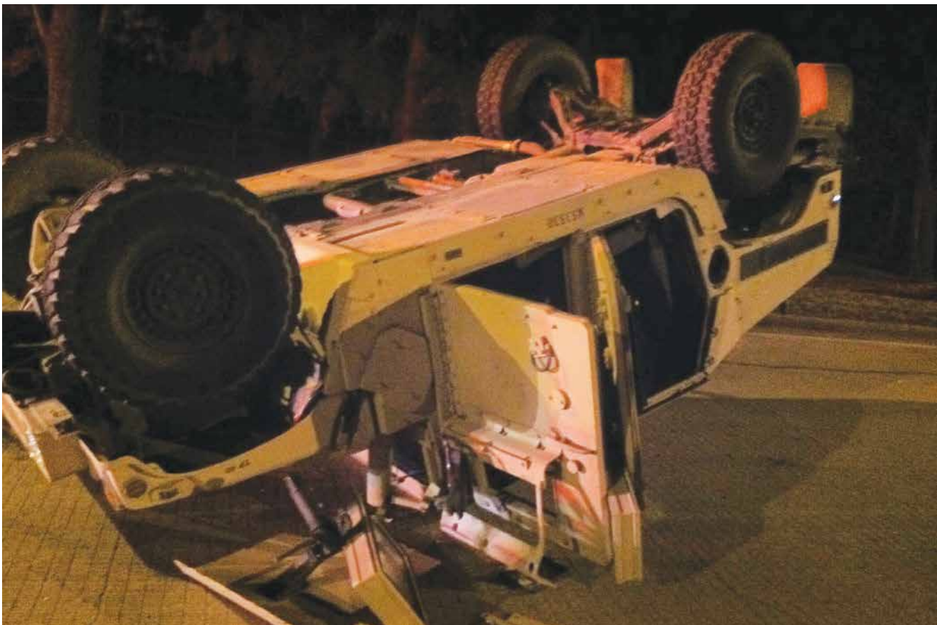
The scene of the Humvee rollover.