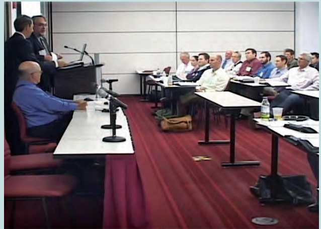
The November 2011 training session in Washington, D.C.

Once they have attended a day-long training session and accepted a Pro Bono Program case, volunteer attorneys receive the current year's edition of the Veterans Benefits Manual , an exhaustive guide that provides lawyers and advocates with information about how to obtain VA benefits for veterans and their family members, and how to practice before VA and the Court. The Veterans Benefits Manual set includes a copy of current federal statutes, rules, and VA regulations and a companion CD-ROM containing 16 searchable databases. Volunteers also receive a subscription to The Veterans Advocate ® veterans law journal.